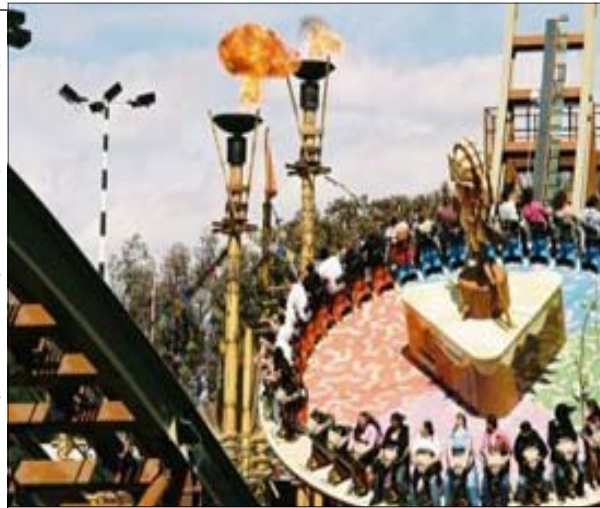
Paramount's Great America—Northern California

Great America has a wide variety of rides, foods, and arcade games. One of the biggest attractions and the most fun rides in Great America is the Drop Zone. In this ride you go to the very top of a 22 story tower then drop all the way to the bottom in less than 4 seconds. The ride is meant for adventure seekers and